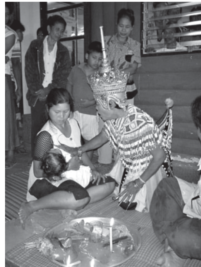
Southern ritual ceremony to heal an ill child.

It was within this colonial context that Siam undertook modernization. Colonial Britain was forcefully making its way into