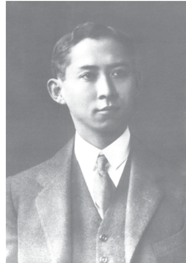
Prince Songkla is the Father of Thai Modern Medicine.

In 1924 Prince Songkhla, the father of the current King of Thailand, attended a meeting to reorganize medical education. Prince Songkhla had just graduated from Harvard University with a degree in public health. Because he was not qualified as a medical doctor, he was ridiculed by medical doctors for making comments on health policy. The incident prompted him to leave Siam, return to the United States to further study medicine, and become a medical doctor. Prince Songkhla was later named the Father of Thai Modern Medicine. The incident suggests that very early in the history of medicine in Thailand, medical doctors were an exclusive social class. As the professional authority further consolidated, medical doctors held absolute power regarding how health systems should be organized. This professional sovereignty set the stage for succeeding developments in which Thai health systems have been heavily dominated by the biomedical perspective, which has permeated the entire society in less than half a century.