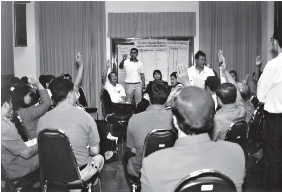
138 Regardless of gender or religion, ordinary citizens made their voice heard at civic forums.

encouraged local people to rethink and reclaim their active roles in determining the characteristics of the national health system. The process of deliberation was an active learning process in which people came to understand themselves as active citizens and not just passive subjects of the state. This civic education was evident in how the process brought about deep contemplation and collective reflection on issues such as the values of local indigenous healings or the social origins of diseases, and the needs of healthy public policies.