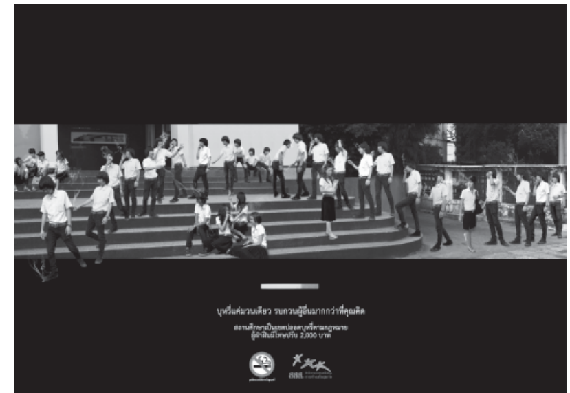
A successful anti-smoking campaign has been launched for 20 years in Thailand.