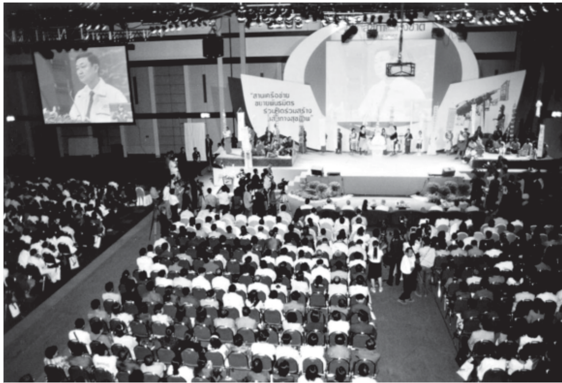
Through innumerable civic forums, a new form of public life merged as shown at the National Health Assembly in 2002, attended by a then-Prime Minister.