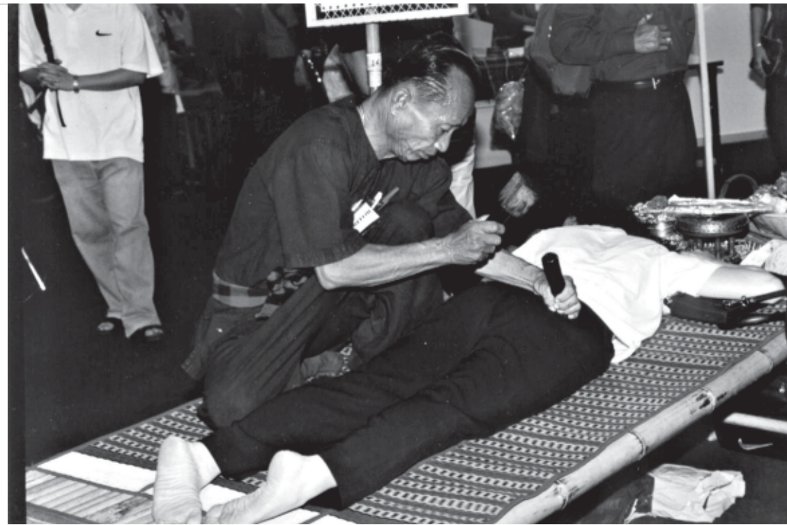
One of the traditional Thai massage techniques uses pressure by hammering tender, pressure points and energy lines, or Sen , by an iron rod.

Forums and meetings among indigenous healers, developmental agencies, and local health authorities also reduced the tension among the groups. Dialogue and informal exchange greatly enhanced trust and reduced intolerance. In the past, encounters between indigenous healers and state health officers often resulted in dissension due to mistrust. Many indigenous healers were prohibited from practicing their arts of healing because local health authority considered them as illegal and superstitious. After a period of regular meetings, there was an increase in mutual understanding. The rigid application of rules and regulations against indigenous healing has gradually relaxed. Indigenous medicine for self-care, complementary care and psychosocial support, and healing practices performed by