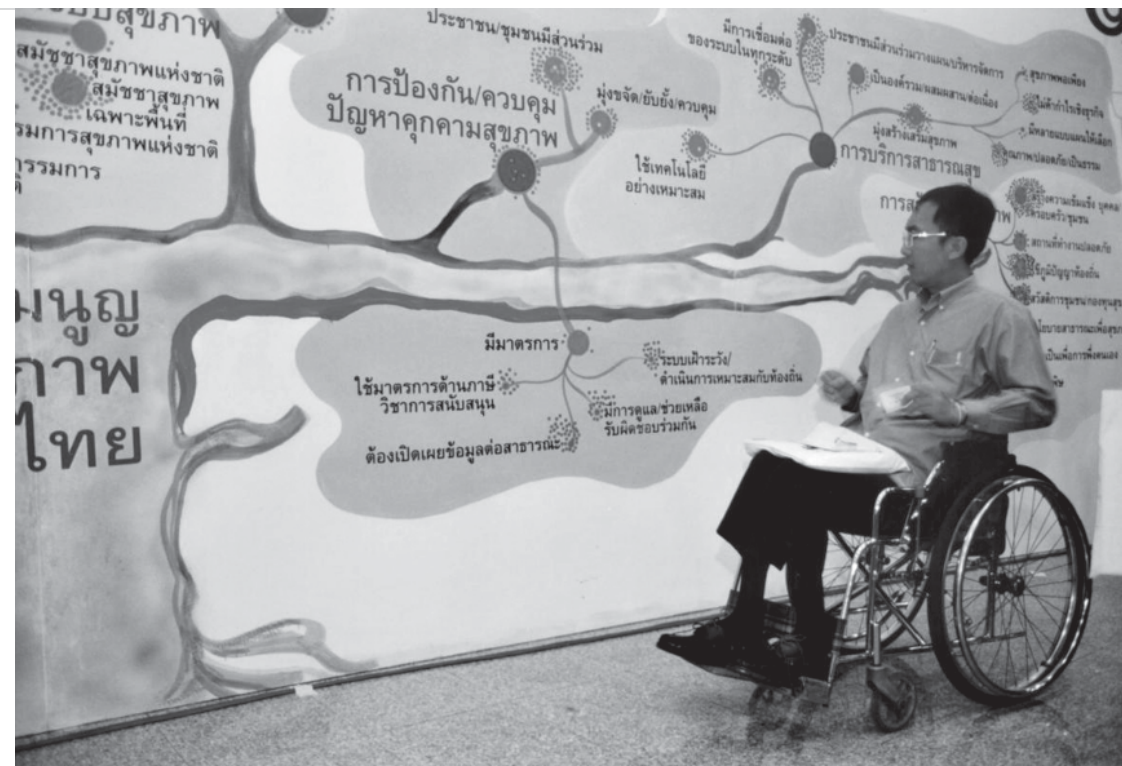
A grown-up tree from the national health assembly represented a civic perspective on Thailand's health system.