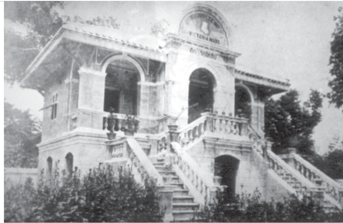
Victoria Building was for elite patients in the early stage of Siriraj Hospital.

During recent decades, Thailand has witnessed progressive development in health status. National health indicators have shown significant improvement. The life expectancy at birth of Thai people