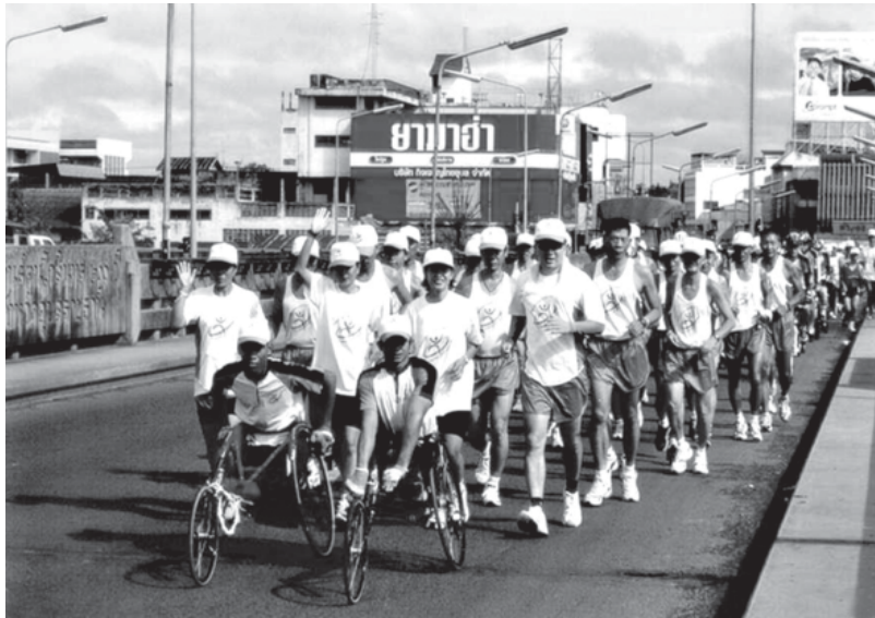
A running campaign for the draft National Health Bill reflected the effort of civic community to achieve democratic form of governance.