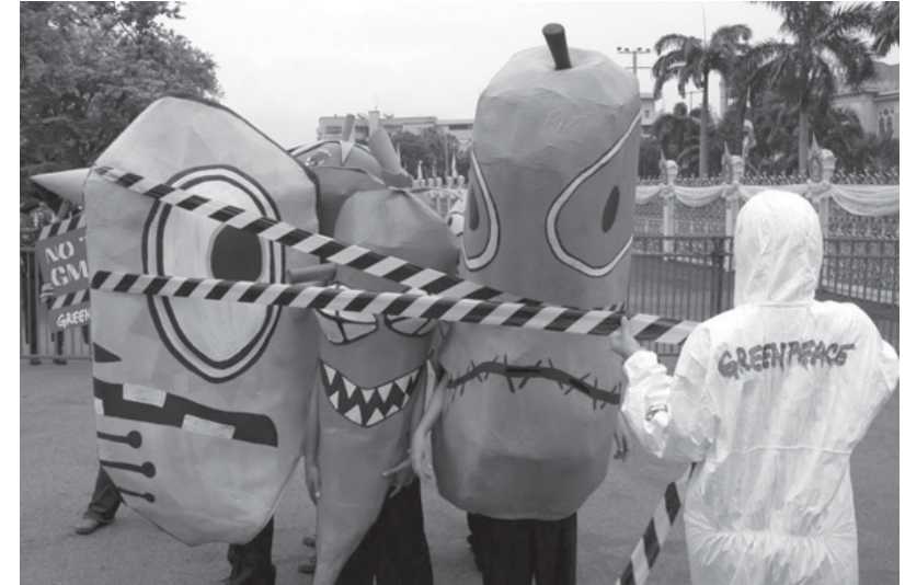
Green Peace uses campaign and media to mobilize public opinion against unsustainable agriculture.

Not only the financial support for nonprofit organizations increased in the last two decades, these organizations became much more effective than many international bureaucracies. Amnesty International and Human Rights Watch, for instance, have created great impact and have already changed state human rights practices in a number of countries. Green Peace International's media facilities and communication networks were extremely effective; it even had its own satellite link. Through its extensive communication networks, the organization could send out photographs to newspapers